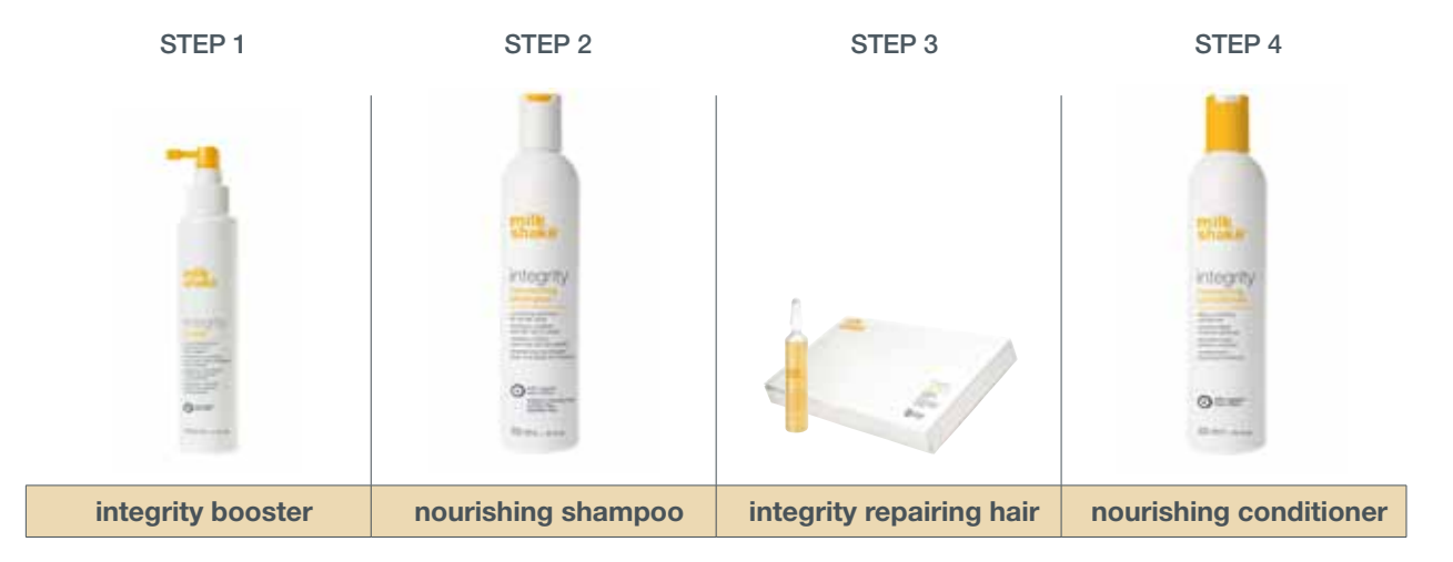
Restructuring treatment for dry/damaged hair